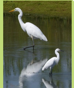
Great White Egret and Little Egret, Aug 2016

We should have a bird expert with us to answer our questions.