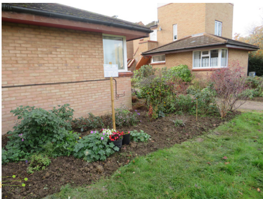
A view of the recently planted Twin Gardens extensions at the entrance to our Local Park.

Despite the summer drought, they are already well established and should produce an increasingly colourful show year on year.