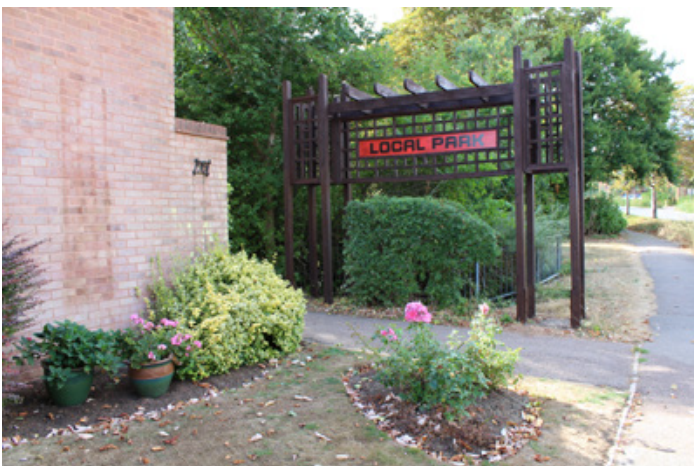
The sign at Clay Hill entrance now fully restored

TMAEG's main summer project was the refurbishment of the two Local Park signs, done by ten TMAEG volunteers over four Saturday mornings in August. It has been widely praised. More about this story on our website, here .