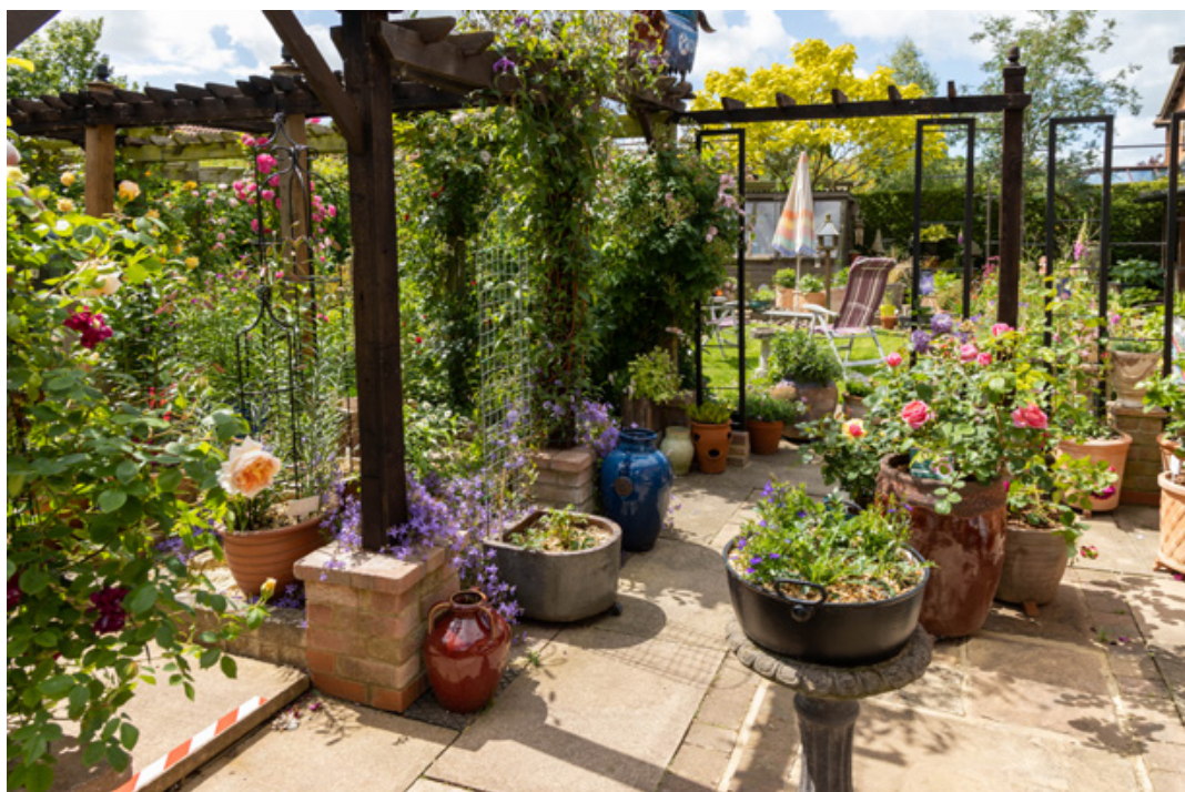
A pergola and a rose garden – by Suzanne and Brian – just part of a beautiful, peaceful garden