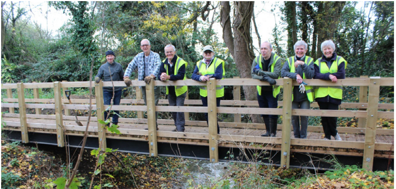
TMAEG volunteers on the bridge – the Bluebell project continues!