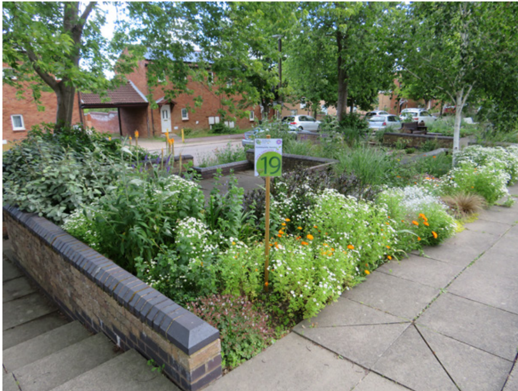
The High Street Community Garden – providing a lovely place to sit and walk in our central space.