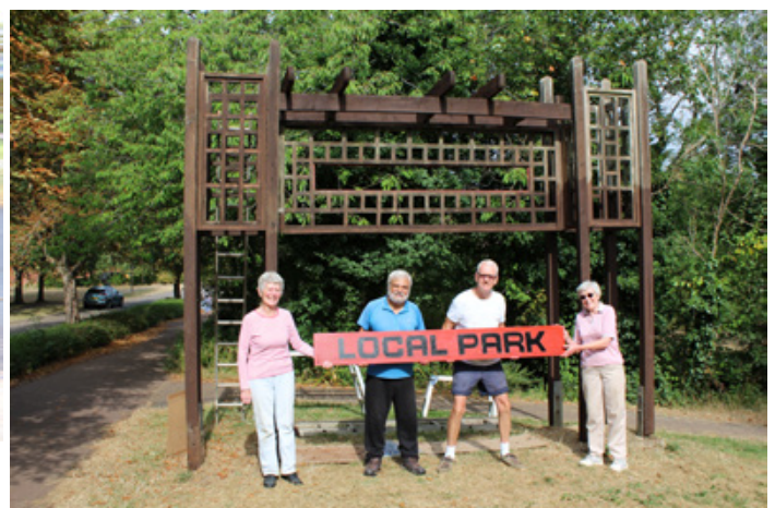
The High Street sign under renovation