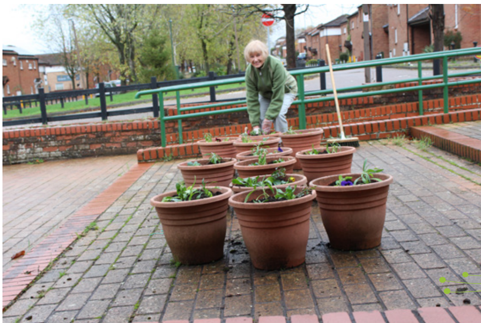
TMAEG works with Ashbrook School to maintain the tubs on the school's frontage.

The winter flowering plants Pavla is putting in here follow the mixed daffodils and should together create a striking display.