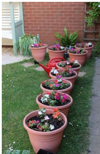
Bedding plants prepared for the Ashbrook School site by Pavla, having been nurtured from plug plant stage by Anne.

Our photos show some of the projects conducted during the last couple of months.