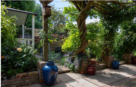
Suzanne and Brian's garden

Try it yourself: Open Gardens Gallery 2020