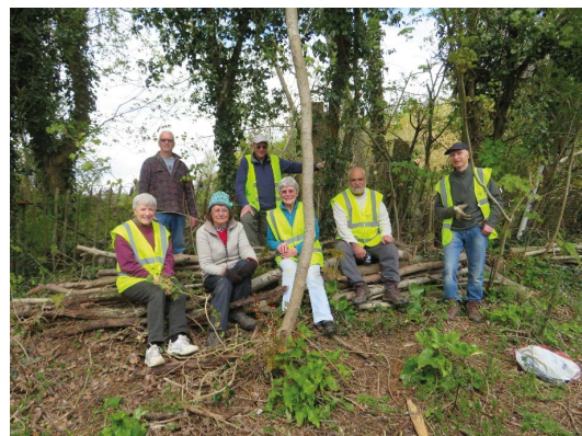
Volunteers at TMAEG's Edge of Golf Course site taking advantage of their newly built log pile for a short mid-morning break