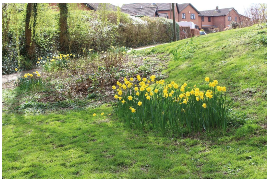
One of three clusters of Marie Curie daffodils planted along the redway serving Fairways