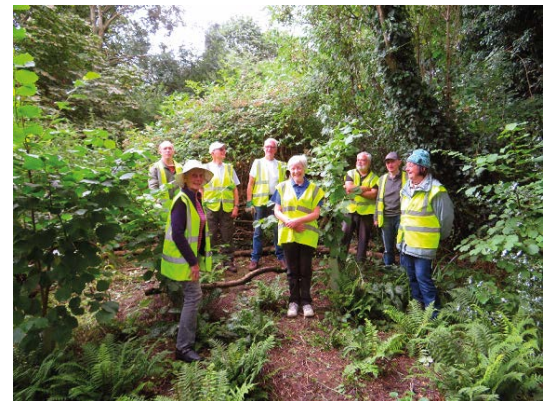
Our volunteers at the Fernery amidst hollies, hazels and thriving ferns

The newer gardens at the Park Gateway and Kepwick II blossomed into magnificent maturity and some earlier projects like the Woodland Walk (Milesmere/Thornclyffe), the Edge of the Golf Course and the Bee Garden and Fernery were enhanced with new planting, natural hedges and glades.