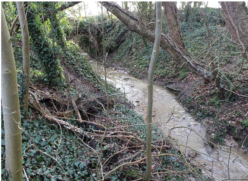
The bridge location at the edge of the plantation. This picture was taken in January 2020 at a time when the stream was in full spate.

The second is the news that we have won a substantial grant from Milton Keynes Community Foundation. The precise sum is £5061.00 which will fund the steel and timber structure of the 11m footbridge (together with some publicity costs).