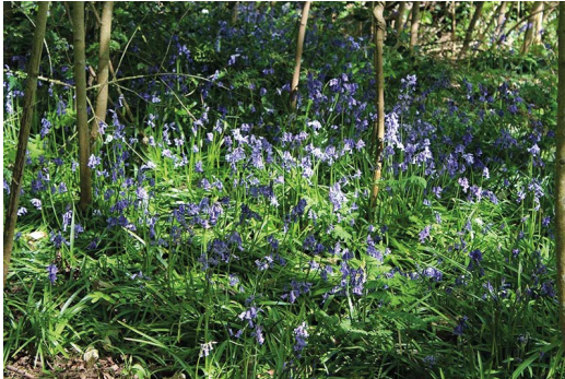
English Bluebells in bloom in the Parks Trust plantation

It certainly has been a challenging but exciting Tenth Year of TMAEG. In particular, I am delighted to be able to announce two major successes for our biggest project, the Bluebell Circuit.