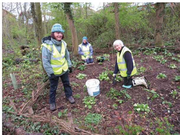
TMAEG volunteers tending English primroses alongside the Milesmere/Thornclyffe Woodland Path. This path is an existing part of the Bluebell Circuit.